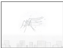
Joseph K., There He Was, There He Is