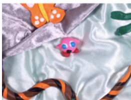
Filmmakers at Philadelphia's Riverside Correctional Facility for Women, You Can Go Left or Right