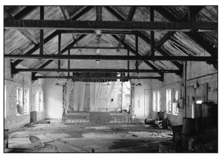
Eastern State's chapel on the second floor of the Industrial Building.