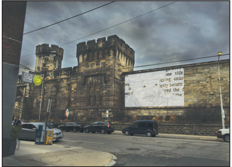
Artist rendering of the Projection Project, slated for 2019. Image: Last Day of Freedom, courtesy of Living Condition LLC.

Visitors will be welcomed into a climate-controlled atrium with striking views of Eastern State's historic towers. Nearby modern restrooms will be the first ever offered to visitors. The space will provide a group tour gathering place protected from the weather, and a comfortable venue for small evening events 12 months a year.