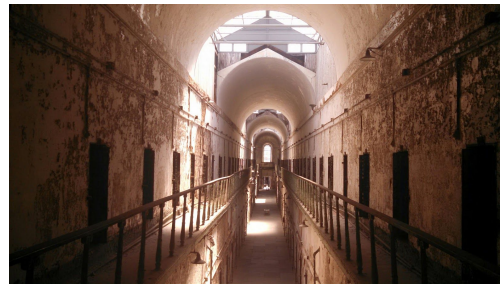
Two-Story Cell Block with Barrel Vaulted Ceiling