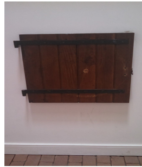
Original Feeding Hole Design