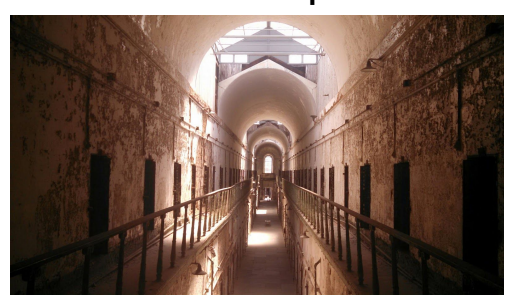
Two-Story Cell Block with Barrel Vaulted Ceiling

Once you finish Audio Stop #10, turn the page.