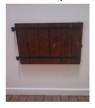
Original Feeding Hole Design