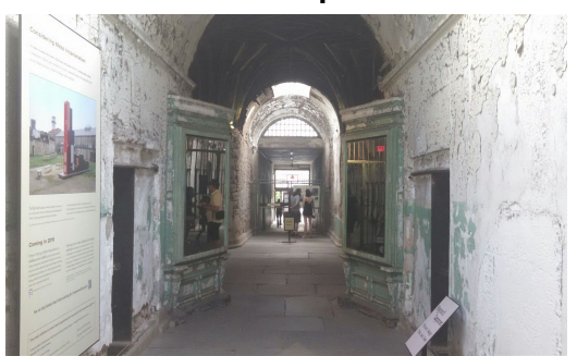
Surveillance Mirrors and Cell Block Expansion