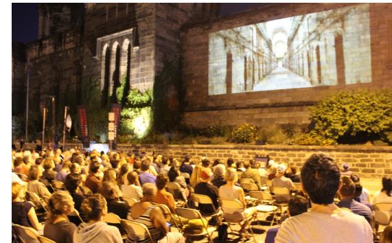
Top and Bottom Images Hidden Lives Illuminated , Summer 2019

Thanks to the generosity of our supporters, 2019 was a groundbreaking year – full of exciting experiences and major milestones. From 29 nights of film screenings and events during Hidden Lives Illuminated to the first phase of construction on our planned visitor center, our donors, members, and friends helped make 2019 our best year yet.