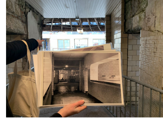
Above Images The newly preserved Soup Alley

more than last year. Our year-end giving appeal was our most successful campaign to date, and members were thrilled with the launch of our newly redesigned membership program.