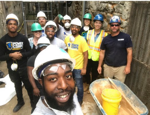
Top and Bottom Images Masonry workshop with partners at Pullman-SST, PowerCorpsPHL, and the International Masonry Institute.

We preserved history and helped pave the way for future generations. Last summer, we developed a masonry workshop with partners at Pullman-SST, PowerCorpsPHL, and the International Masonry Institute. Over the course of two weeks, eight young adults removed Portland cement mortar from Cellblock 3's exterior walls and replaced it with historically accurate, structurally appropriate lime mortar. In addition to providing much needed stability to Cellblock 3, the workshop gave the participants on-the-job experience and introduced a new generation to the field of historic masonry.