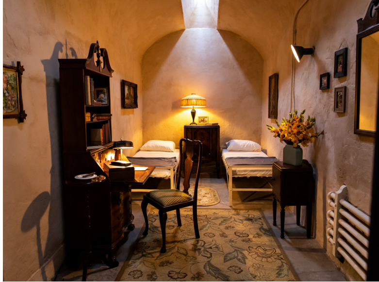
Groundbreaking ceremony for our planned visitor center.

We broke records again in 2019, welcoming more than 300,000 daytime visitors.